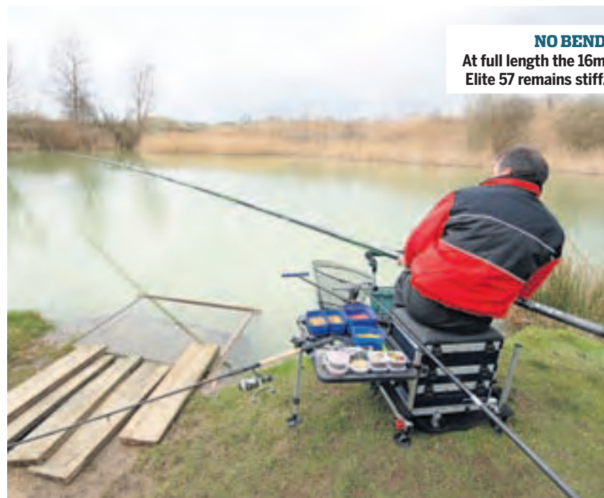
NO BEND At full length the 16m Elite 57 remains stiff.

Having total control over the pole at full length is essential when doing this task, otherwise you'll be spreading bait all over the